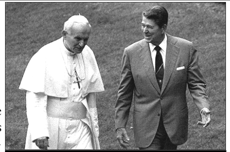
Pope John Paul II and President Reagan in private conversation, Miami, September 1987

Pope John Paul II, addressing President Reagan during his visit to the United States in 1987, remarked: “From the beginning of America, freedom was directed to forming a well-ordered society and to promoting its peaceful life. Freedom was channeled to the fullness of human life, to the preservation of human dignity and to the safeguarding of all human rights. An experience in ordered freedom is truly a cherished part of the history of this land...The only true freedom, the only freedom that can truly satisfy, is the freedom to do what we ought as human beings