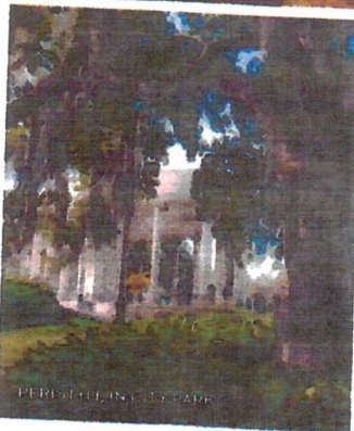
PERSHING BUILDING CITY PARK